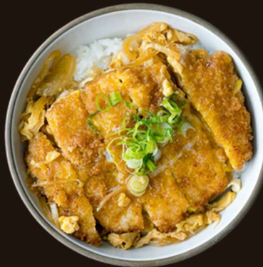
Katsu Don (chicken) $15.85 Deep-fried chicken/ egg, mushroom, onion on rice