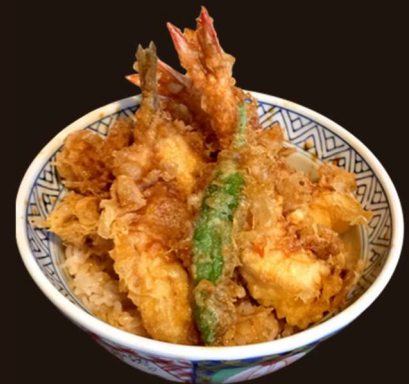
Tempura Don $15.85 2pcs shrimp tempura, 3pcs vegetable tempura, egg, mushroom, onion on rice