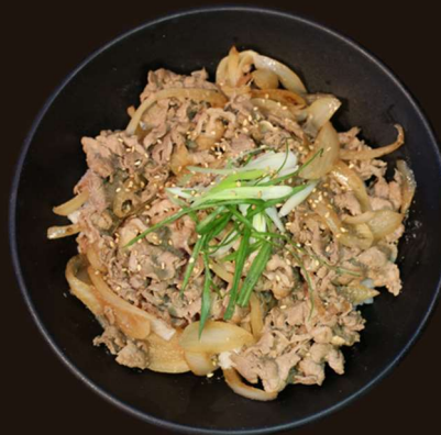
Gyu Don $15.85 Grilled beef, egg, mushroom, onion on rice