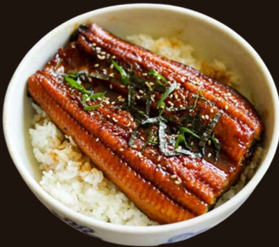
Unagi Don $19.95 BBQ eel, w/unagi sauce

Large bowl of rice topped with your choice, served with miso soup