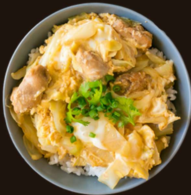
Oyaku Don $15.85 Grilled chicken, egg, mushroom, onion on rice