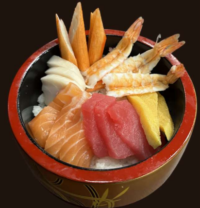
Chirashi Don $24.99 Assorted sashimi on sushi rice